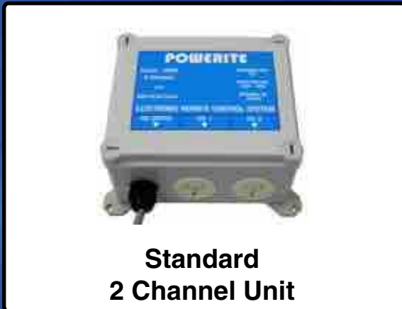
Standard 2 Channel Unit