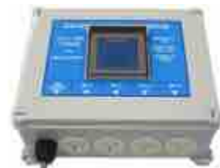
4Ch Local Module Fitted to 4Ch Unit