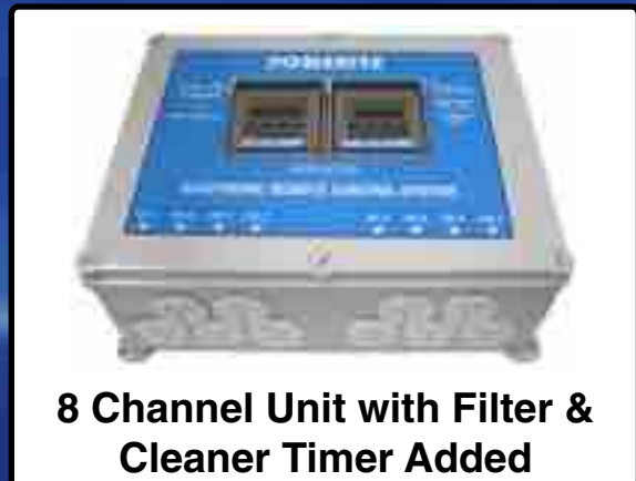
8 Channel Unit with Filter & Cleaner Timer Added