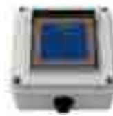
4Ch Outdoor Remote Module