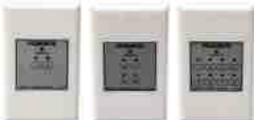
2Ch Remote 4Ch Remote 8Ch Remote

To provide Local and Remote Control and indication of the operation of the system a local or remote hard wired module can be fitted.