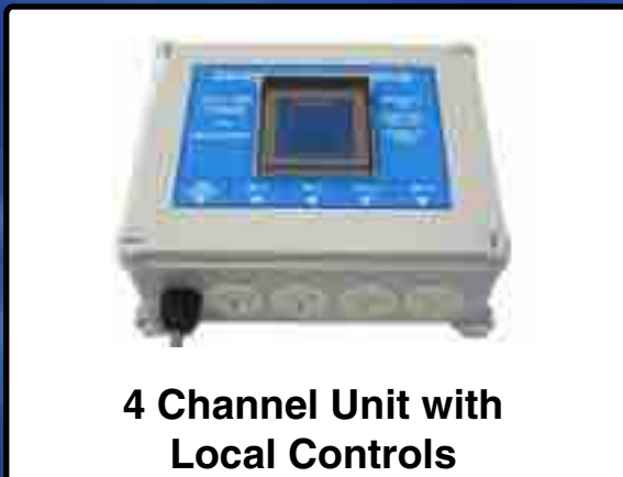
4 Channel Unit with Local Controls