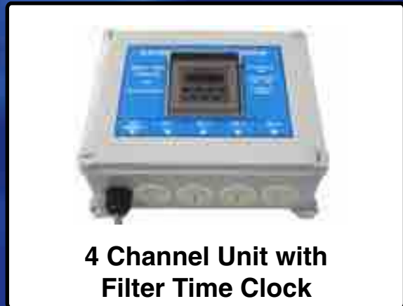
4 Channel Unit with Filter Time Clock